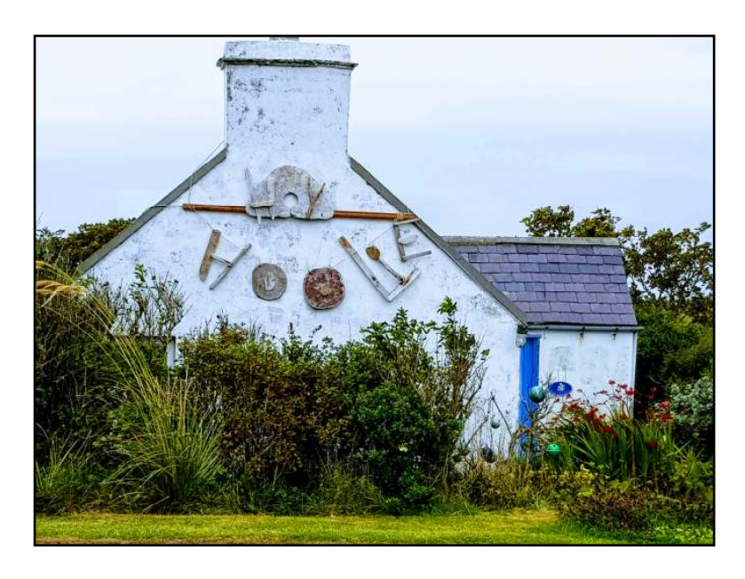
Hoy Hoolie 2018 was a great success and we would like to say thank you to:

All the volunteers of the Hoolie gang that worked so hard and are too numerous to mention individually;