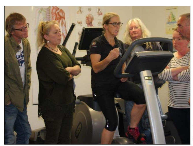
Why not join up and get rid of all that Christmas excess!

The Healthy Living Centre will be closed from Monday 25 December till Sunday 7 January. Sessions will resume on Monday 8 January. The buddy system will be available during this time.