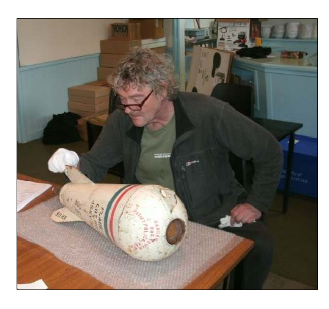
Volunteers helping to pack and record the exhibits.