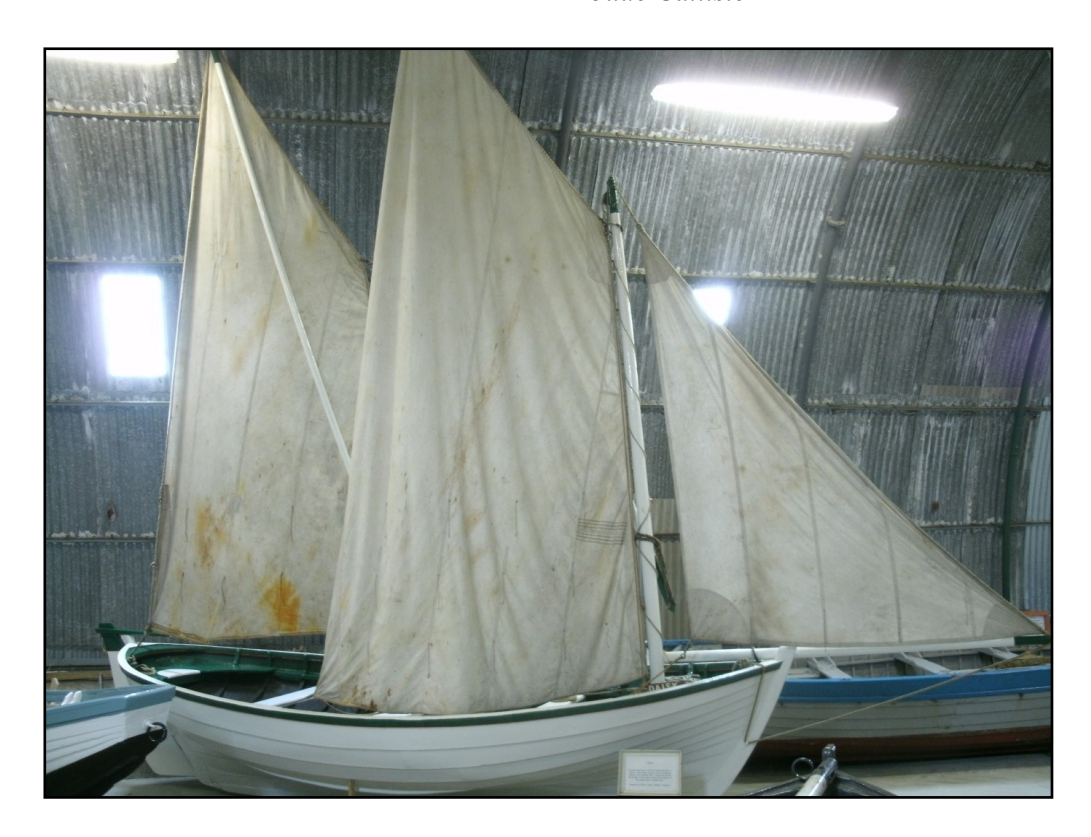
The Daisy on display in the Romney Hut