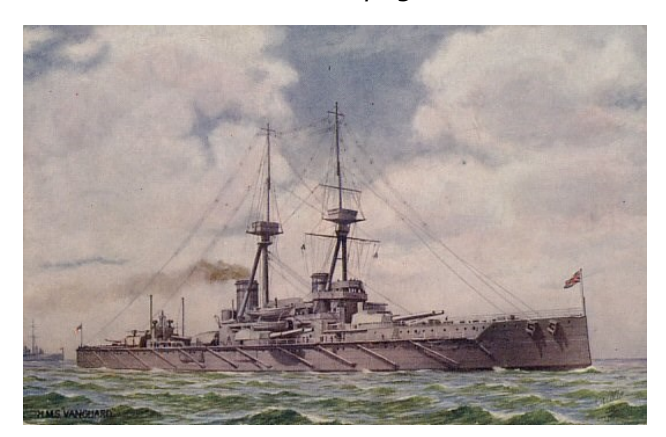
Postcard of the Vanguard circa 1915

Commemorations will be held this summer to mark the huge loss of life when a Royal Navy battleship was blown apart while at anchor at Scapa Flow in Orkney. A series of internal explosions destroyed HMS Vanguard in an instant on the night of 9 July 1917. Just two of the 845 men on board survived. The catastrophic loss of Vanguard, a dreadnought battleship which had seen action at the Battle of Jutland, is one of the most tragic accidents in the history of the Royal Navy. The many hundreds of casualties will be remembered later this year on the centenary of the sinking.